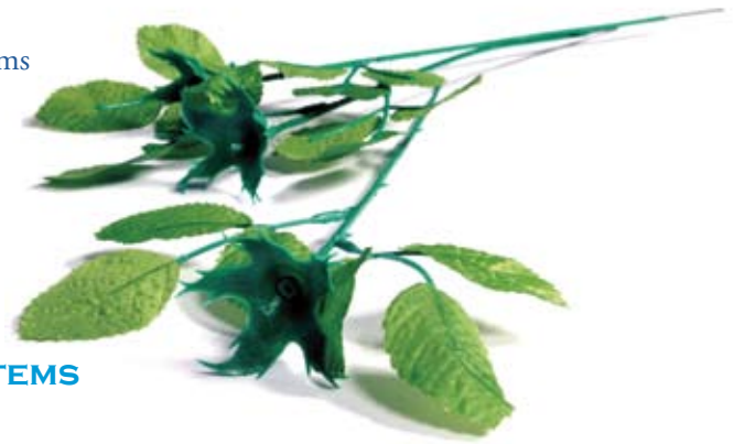
ROSE STEMS 100/case. A-113